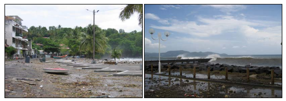
Figure 3. The consequences of "Dean" hurricane in Martinique, France

The natural hazards for high altitude areas (e.g.: Switzerland) is most useful as it highlights the slopes which present a higher risk of avalanches, ice accumulation, collapses, floods caused by glacial lakes overflows, ice melting, ice avalanches, glacier melting, combinations and variations of these as well as chain-events corresponding to these phenomena (Eitzinger and Wiedemann, 2007). Examples: floods caused by the melting of ice (a volume of over 3 m<sup>3</sup>, speeds reaching more than 40.000 mc/s on distances of 1200 km); torrent activity etc. Also in high altitude mountain areas, glacierrelated hazards and permafrost can damage the tourist infrastructure due to floods etc. (Kaab et al., 2008). All of these represent an important data source which can be used in territorial planning and tourist administration.