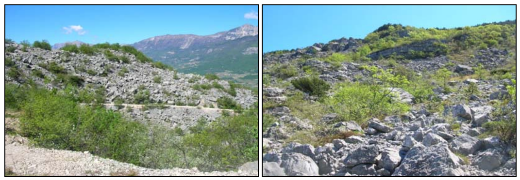
Figure 1a and 1b. Landslides from Lavini di Marco, Italy

By introducing a great amount of energy into the slope system, earthquakes can trigger landslides, collapses, tumbling rocks etc. which can substantially modify the geomorphologic landscape of a certain region. Such was the case in the Lavini di Marco landslide, in Italy (fig.1 a, b) described by Dante Alighieri in his Divine Comedy as follows: (in translation) "Over the edge, an enormous rock slide led down through a desolate mountainous terrain that was appalling to see. It resembled the lifeless slope of stone that tumbles down to the left bank of the River Adige, all of the way to Trent, the result of some massive earthquake."<sup>3</sup>